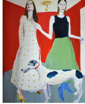
(L-R) Thomas Dillon, Expecting to Fly , 2024, acrylic on canvas, 228.6 x 198.1 cm | 90 x 78 in; Adrián Navarro, Paraíso 9 , 2024, oil, acrylic, spray paint and oil pencil on canvas, 153 x 75 cm | 60.2 x 29.5 in; Xevi Solà, Two Meninas , 2024, acrylic on canvas, 162 x 130 cm | 63.8 x 51.2 in